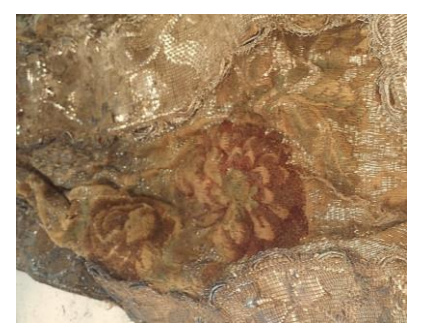
Fig.3. Silk thread fabric, Sacos.

The spectral analysis in the IR domain of the two textile samples taken in red and green was performed in order to know their nature.