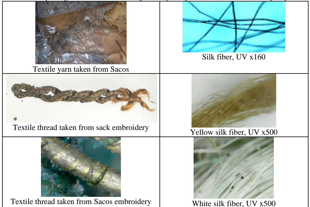
Table 1. Morphological characterization of textile yarns from the textile structure of Căpriana

During the research by optical microscopy in incident white light, the presence of 4 types of threads was found: textile threads from fabric, textile threads from embroidery, metallic threads from fabric and metallic threads from embroidery. The textile yarns are made of natural fibers and are of a protein (silk) nature according to the results provided by OM-UV. Simple metal wires are tape or wire type and metal wires helically wound on textile core, tape type and wire type.